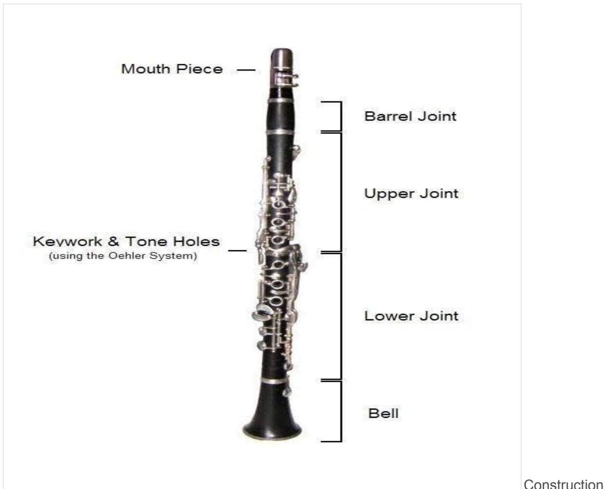
of a clarinet

2. Look at the parts of the clarinet on the diagram below. Can you draw your own picture of a clarinet? Here is a really good step-by-step guide to help you draw your own clarinet . Can you label at least a few of the parts? Be sure to include the mouthpiece, the keys, and the bell.