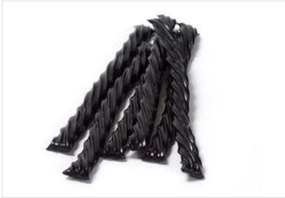
Licorice Clip Art Library

4. The clarinet has a nickname. Sometimes it's called a "licorice stick." Can you think of why it might have this nickname? Look at your picture of a clarinet and then at the picture to the right if you need a hint.